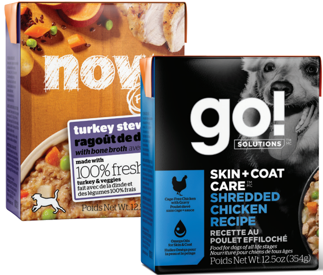
+ 100% of wet food in Tetra Pak® cartons