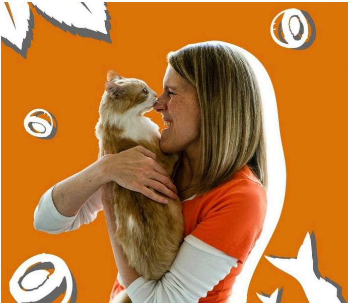
+ Dedicated Sustainability Manager